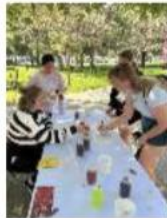
Signing up for LCM!