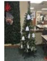
MSU Angel Tree