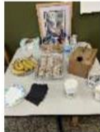
Weekly Brunch & Bible