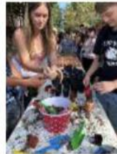
Welcome week events