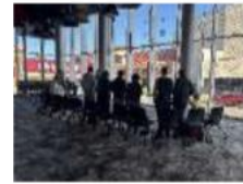
Worship on campus